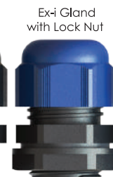
with Dome Plug & Washer