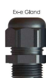
with Dust Plug & Gasket